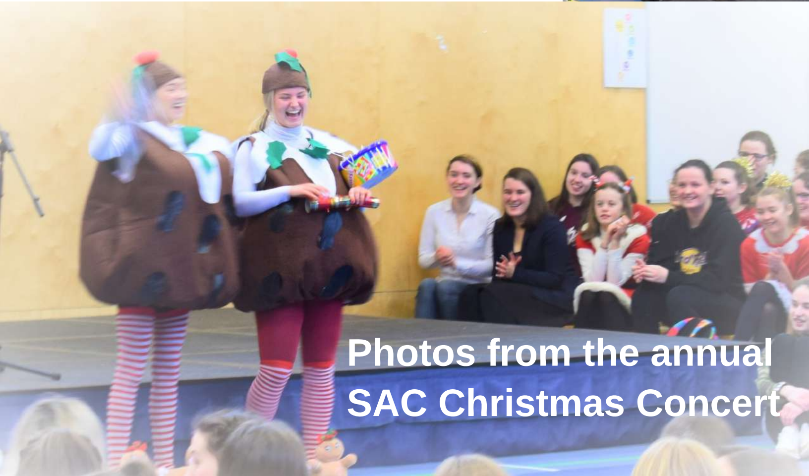
Photos from the annual SAC Christmas Concert