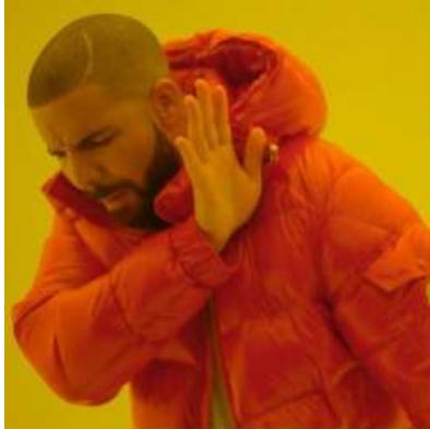
new school jacket