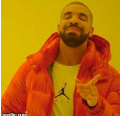
old school jacket